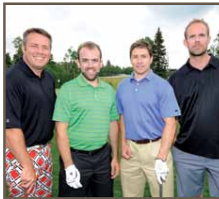
Walton Development and Management L.P.