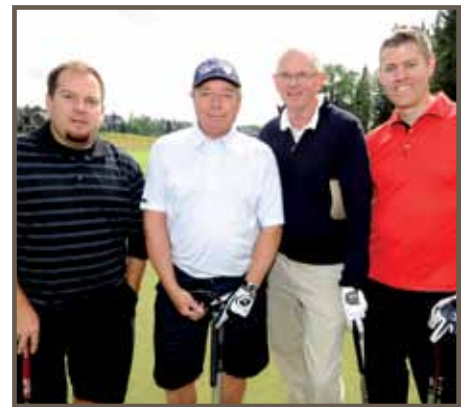
Brookfield Residential Properties