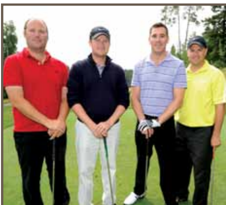
TD Real Estate Group