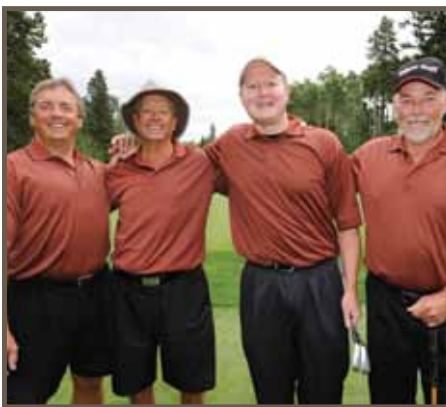
Nu-Way Floor Fashions