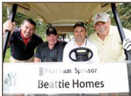
Beattie Homes Ltd.