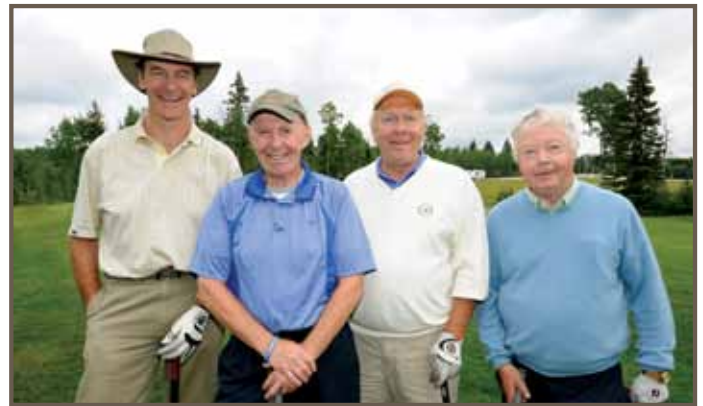
Prostate Cancer Graduate Team