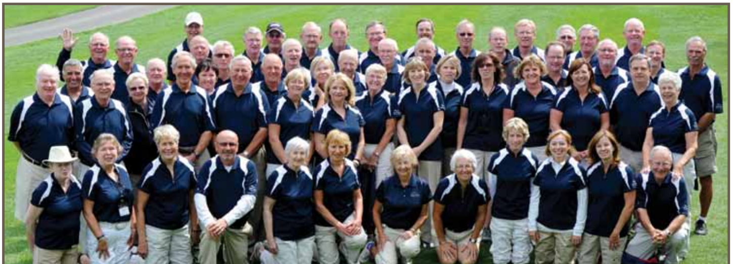
Thank you to all volunteers